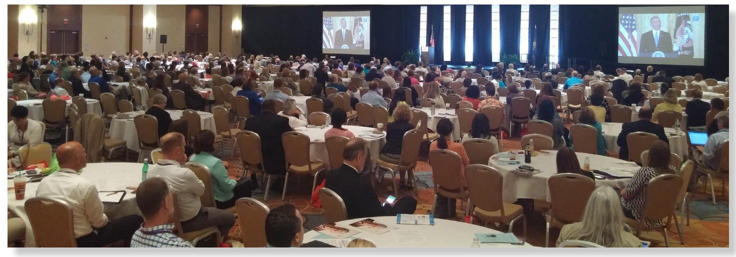
NEARLY 900 PEOPLE ATTENDED THE NATIONAL ASSOCIATION OF AREA AGENCIES ON AGING (N4A) WHOOA WATCH PARTY IN PHILADELPHIA.

Due to this and other factors, a growing demand for professional caregivers is expected, which raises issues of recruiting and retaining the direct-care workforce. Direct care is a demanding profession with low wages, long hours, and limited benefits. It is critical for there to be efforts to recruit and retain a sufficient number of direct-care workers to keep pace with the growing need.